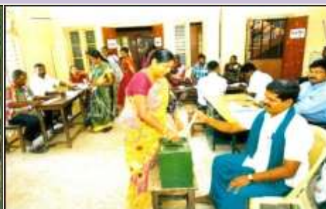
A member casting her vote in the Co-operative Election