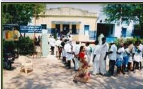
Members of a Primary Agricultural Co-operative Credit Society in a village showing keen interest in Co-operative Elections